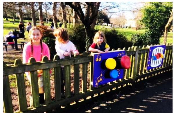
Having fun with music in Dane Park

'The hills are alive with the sound of music' and now so is Dane Park, as the latest installation by Colourful Margate allows Thanet families to emulate the Von Trapps. We are excited that we installed three outdoor musical instruments, namely bongos, a