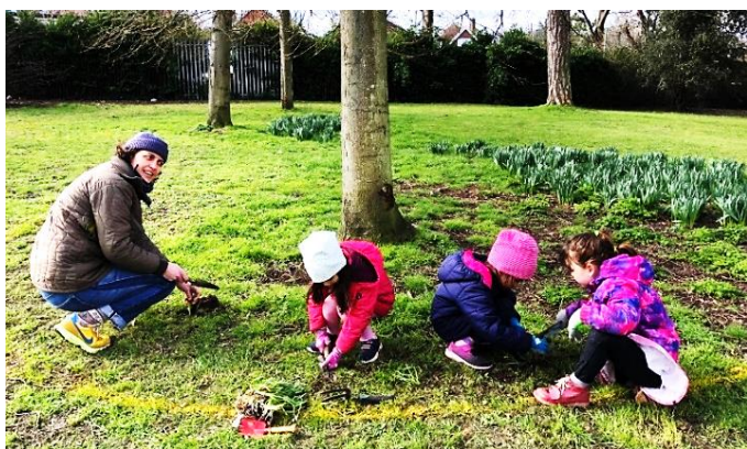
Planting bulbs in the park

To make lockdown colourful, residents came out in their lockdown bubbles in December to plant 220 flower bulbs of Narcissi, Daffodils and Crocuses near the old Walnut tree (close to the fountain). Crocuses blossomed beautifully over the last weeks. Another 'bubble bulb planting' in March 2021 involved several bubbles of families from Dane Valley Ward and Cliftonville West who planted another 1,200 'bulbs in the green' of English Bluebells and Single Snowdrops, that were provided by the Bumblebee Conservation Trust (Thank you!). This time, we decided to plant them near the Fairy House woodcarving (commissioned by Colourful Margate in 2018) right next to the existing daffodil area. Our vision is to keep planting in that area of the Park in order to create an enchanting spring flower section for everyone to enjoy.