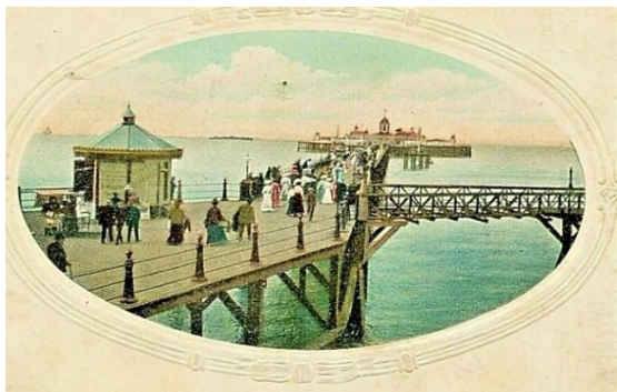
Above: Westbrook beach, Westbrook pavilion (Westbrook was also known as Westonville), Margate main sands and the Jetty, Margate at the turn of the last century.